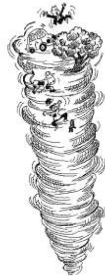
The Staff Vacuum

Areas such as Tertiary Education & Aged Care have also come under revised Federal/State legislation, also compliance-based. Typical of this is the AQTF for the education area.